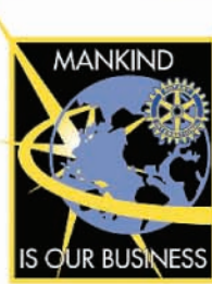
2001-2002 R. I. Theme