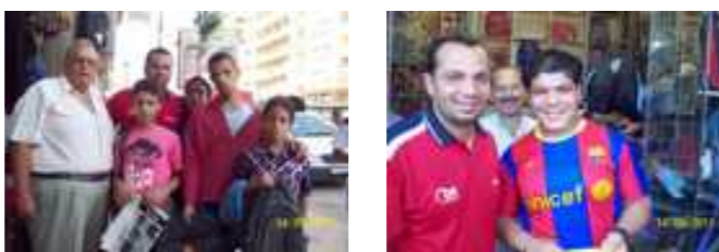
Tired and happy with their new school bags and shirts